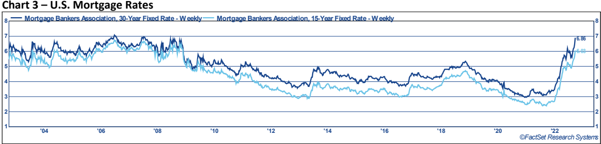
Chart 3 – U.S. Mortgage Rates

There are signs below-trend growth is already taking hold as GDP and corporate earnings estimates are moving lower. Additionally, with the sharp rise in mortgage rates, the housing market is quickly weakening as home prices are starting to fall, inventories are on the rise, home builder confidence has plunged, and monthly new and existing home sales have been trending lower. The Fed is looking for this weakness to expand into other areas of the economy hoping that it will lessen demand and soften the labor market as well.